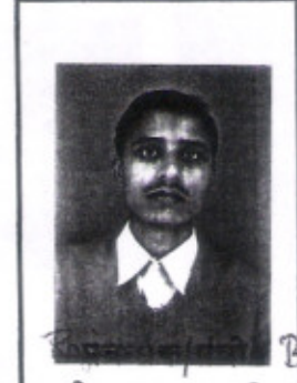
आर० पी० यादव महाविद्यालय महुली बाजार-संत कबीर नगर